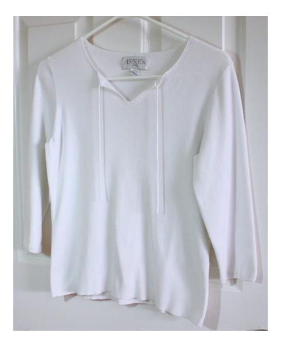
I couldn't believe the transformation!

This sweater still had lots of wear in it but the boxy cut and tie at the neckline made it a candidate for the donate pile. That is, until I received a roll of May Arts Denim Ribbon!