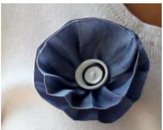
I love my "new" May Arts sweater!